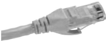
AX330015 GigaFlex PS5E VoIP Modular Cord