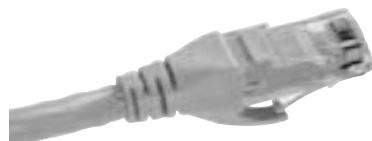
AX380014 GigaFlex PS6+ Bonded Modular Cord

These products are in the process of being assessed for RoHS compliance. Please check our Web Site for the most current RoHS status.