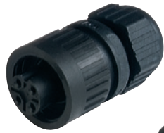
CA 3 LD