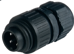
CA 3 LS