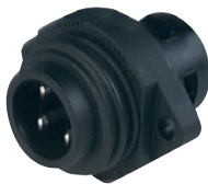
CA 3 GS