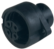
CA 3 GD