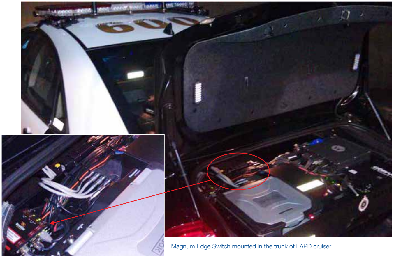
Magnum Edge Switch mounted in the trunk of LAPD cruiser

For the Power Over Ethernet (PoE) line, GarrettCom has developed a range of industrial Power-Source PoE products based on the IEEE 802.3af standard specification supporting security products such as IP-cameras & badge readers. To learn more about GarrettCom's range of hardened and innovative products, visit www.belden.com .