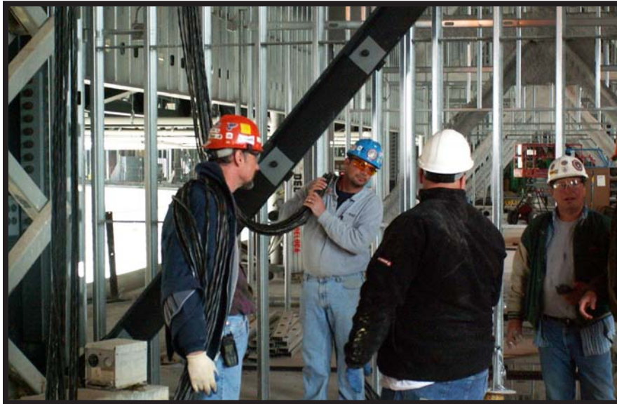
Telcom Services Installation (TSI) of St. Charles, Missouri is the installer of the ballpark's high-tech audio/video system, which reaches into virtually every corner of the stadium premises.

Due to the massive scope of the A/V installation, which reaches into virtually every corner of the stadium premises, TSI required that the broadcast cabling be cut to specified lengths, other than standard 1000-ft put-ups. They also required the pre-labeling of cables and spools, based on broadcast box locations. Both steps save time, increase installation efficiency, and help eliminate errors caused by incorrect measuring.