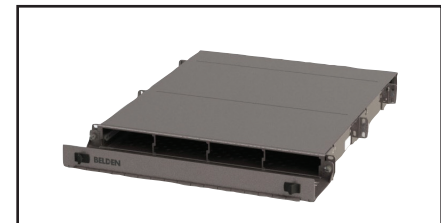
AX104681, FX UHD Patch Panel 1U with Mounted Splice Housing Kit (AX104684)