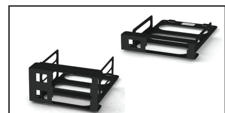
Top: FXFUBRSHM, FX UHD Single Cassette Holder with Magnetic Attachment Bottom: FXFUBRDHM FX UHD Double Cassette Holder with Magnetic Attachment (Bottom)