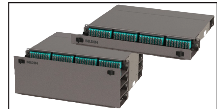
Top: AX104681, FX Ultra HD 1U Patch Panel Housing Bottom: AX104683, FX UHD 4U Patch Panel Housing (shown loaded)

See the FX UHD System Product Bulletin (PB500) for further options